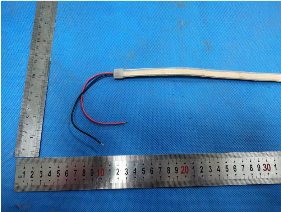
Photo 4 General Appearance of the EUT